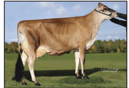
IGL TEXAS MISTY-ET, E-90% Sister to the Grandam of Lot 113