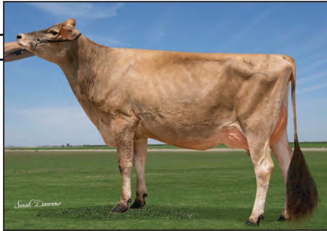
JX FOUR J MESSI 23954 {5}, VG-83% Dam of Lot 116