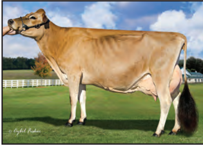
GABYS JACINTO ALYSSA Fourth Dam of Lot 124