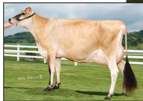
Sold in the 2009 Pot O'Gold Sale Jars of Clay latola 16710 2751, VG-87% 2-3 305 3x 20,230 4.6% 924 3.6% 727