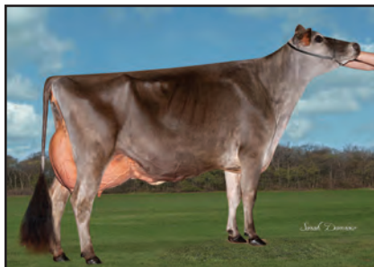
RATLIFF IMPRESSION ANNABELLA-ET Sister to the Dam of Lot 126