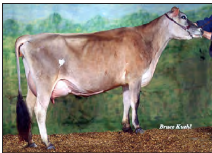
HEARTLAND MOR TULSA Fourth Dam of Lot 104