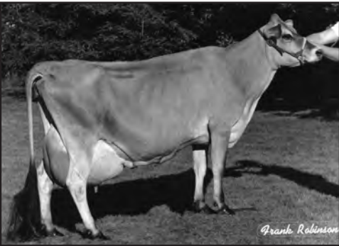
Sold in the 1987 Pot O'Gold Sale Duncan Brave PR Dee, VG-84% 7-3 305 24,920 4.7% 1,165 3.7% 911 Winner, 1990 Pot O'Gold Production Contest