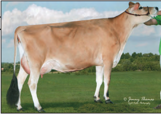
HARMONY-CORNERS LIBBY, E-93% Grandam of Lot 133