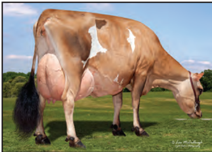
HEARTLAND NATHAN TEXAS-ET Great-Grandam of Lot 104