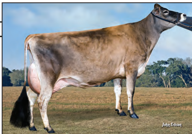
QA/WF VALENTINO DEVINE, E-90% Dam of Lot 125