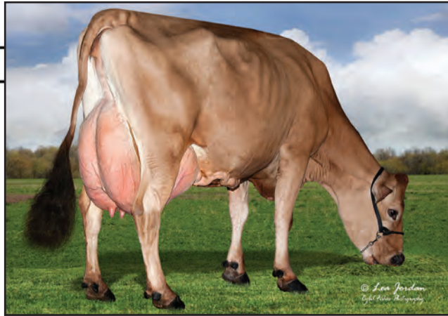
GABYS MEDALIST ALYMPIAN, E-92% Grandam of Lot 124