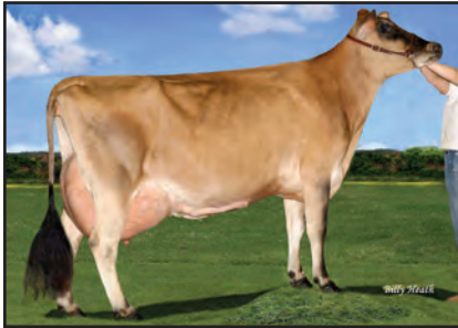
BW LEGION COED-ET Great-Grandam of Lot 128