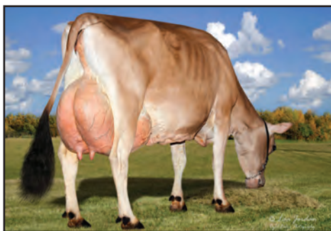
Sold in the 2012 Pot O'Gold Sale Waunakee Plus Jolt 3277 {6}-ET, E-92% 4-5 305 31,380 4.3% 1,362 3.8% 1,200