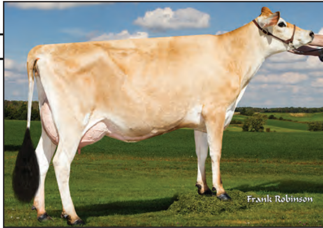
AHLEM ZENITH JOANNE 46141, E-90% Dam of Lot 106