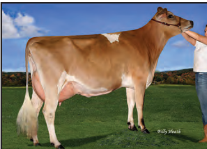
DEERVIEW MERCHANT COED-ET Sister to the Grandam of Lot 118