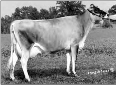
Sold in the 1986 Pot O'Gold Sale Greenwood Chief Glad Tidings, VG-85% 4-6 305 22,590 4.9% 1,097 3.6% 806 Winner, 1989 Pot O'Gold Production Contest