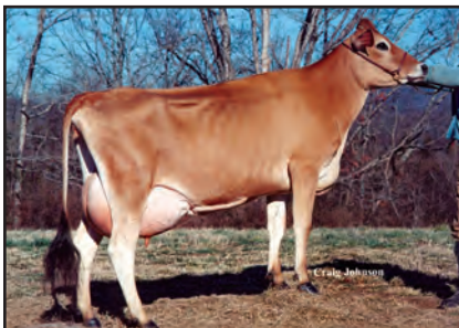
GABYS IATOLA AMETHUST-ET Sixth Dam of Lot 124