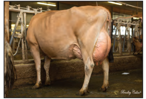
Sold in the 2013 Pot O'Gold Sale JX Shan-Mar Fastrack Cherita {4}, VG-86% 1-11 305 3x 21,390 5.5% 1,173 3.5% 752