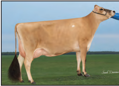
FOUR J MACKENZIE 19373 {6} Grandam of Lot 116