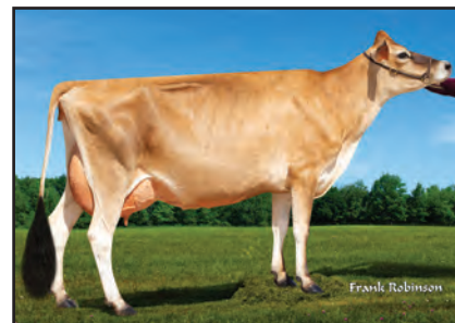
GRAM-WAY CHILI DAPHNE-ET Sister to Lot 124

ALL LYNNS IMPULS VIRGINIA-ET 86% USA 116159979 GT50K BBR 100 JH1F TATTOO / A1164 DHIA HERD # 93-24-0331 CONTROL # 1164 2-02 305 3 18790 4.3 807 3.6 670 93DCR 2220C 3-09 305 3 22950 4.6 1053 3.6 815 71DCR 2813C 5-05 305 3 26290 6.0 1585 3.7 982 93DCR 3397C 305 2X ME AVG 3L 20910M 1063F 774P 2630C PPA 2279M 166F 104P / YD 2068M 152F 97P CDCB GPTA S 10/01/2019 3RECS 92%R 99%ILE 1066M 0.09% 70F 0.06% 50P 605CM$ 574NM$ 508FM$ 4.7PL 0.9LIV -0.4DPR 1.4CCR 1.0HCR 2.93SCS 491GM$ AJCA 10/01/2019 GPTAT 90%R 0.7 GJUI 7.1 GJPI 89%R 167