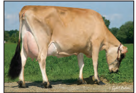
DUTCH HOLLOW JACE MELINDA-ET Fourth Dam of Lot 117