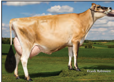
Sold in the 2014 Pot O'Gold Sale JX Buttercrest Clark Goblet {4}, E-90% 1-11 305 3x 20,450 4.5% 919 3.9% 802