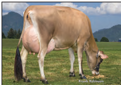
Sold in the 2008 Pot O'Gold Sale Boyd-Lee Matinee Holly-ET, VG-86% 1-11 305 19,120 4.7% 904 3.4% 655