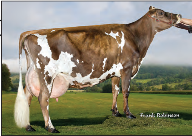
SUN VALLEY IMPULS AMBITION, VG-88% Grandam of Lot 107