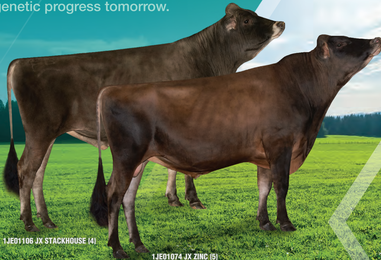
1JE01106 JX STACKHOUSE {4}

Genetic leaders today for genetic progress tomorrow.