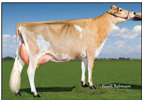
Sold in the 2012 Pot O'Gold Sale JX Grazeland Plus Krystaleen{4}, E-90% 3-0 305 23,550 4.9% 1,161 3.8% 889