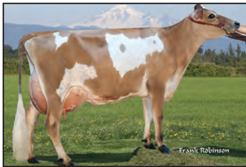
Sold in the 2007 Pot O'Gold Sale Havs latola Topaz, E-91% 3-1 365 43,110 5.0% 2,144 3.5% 1,522 Winner, 2010 Pot O'Gold Production Contest