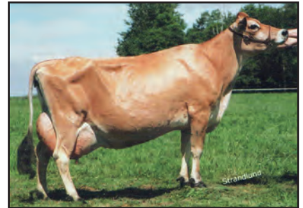
FAMILY HILL BROOK LYNNA Fourth Dam of Lot 133

SC GOLD DUST PARAMOUNT IATOLA-ET USA 112118277 GTHD BBR 100 JH1F 29JE3301 CDCB GPTA S 08/01/2019 18493DAUS 2561HRDS 6%RIP 99%R -293M 0.10% 6F 11%ILE 99%R 0.05% -1P 66CM$ 53NM$ 25FM$ 55GM$ 0.7PL -2.0LIV 0.0DPR -0.1CCR 0.0HCR 2.97SCS AJCA 08/01/2019 9611DAUS GPTAT 99%R 1.3 GJUI 13.1 GJPI 99%R 22