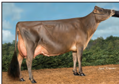
RATLIFF SAMBO ALISON-ET Sister to the Dam of Lot 126