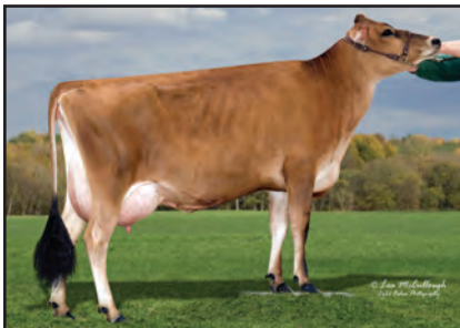
HEARTLAND JIMMIE TUSCON-ET Sister to the Grandam of Lot 104