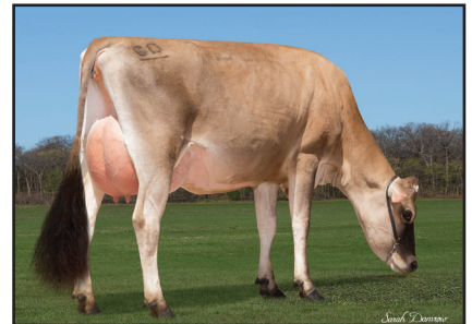
JER-Z-BOYZ PREMIUM CLAIRE {6}-ET