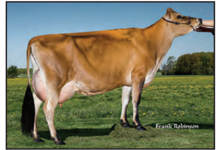
SUN VALLEY T-BONE OATMEAL Sister to the Dam of Lot 107

4TH DAM: SUN VALLEY NINA EARL AMBER 88% 6-04 305 2 21480 4.6 987 3.4 723 100DCR 2497C