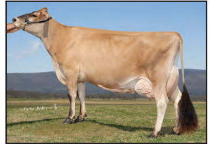
DUTCH HOLLOW JEVON MELINDA 824-ET Great-Grandam of Lot 117

5TH DAM: SC MILLIE 93% 5-03 305 3 30210 4.6 1377 3.1 950 99DCR 3278C