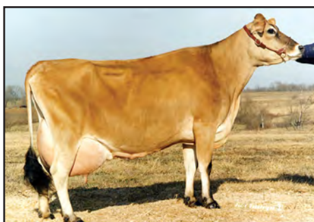
Sold in the 1994 Pot O'Gold Sale LJF2 SB Berretta Haley, E-90% 4-2 365 32,420 5.2% 1,678 4.3% 1,386 Former #1 PTI Cow Winner, 1997 Pot O'Gold Production Contest