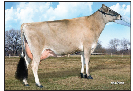
GOFF ACTION CHARLOTTE Fourth Dam of Lot 111