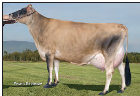
Sold in the 2005 Pot O'Gold Sale Schirm Rocket Vintage-ET, E-90% 4-2 365 40,210 4.8% 1,927 3.6% 1,451