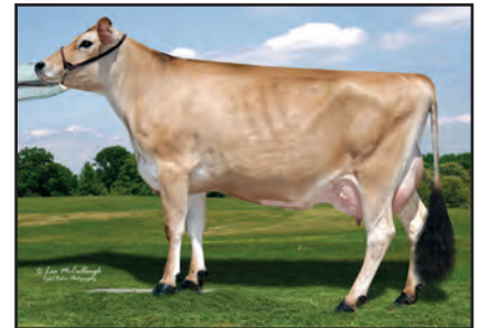
NORSE STAR RENEGADE MARLEY, VG-83% From the Same Family as Lot 113