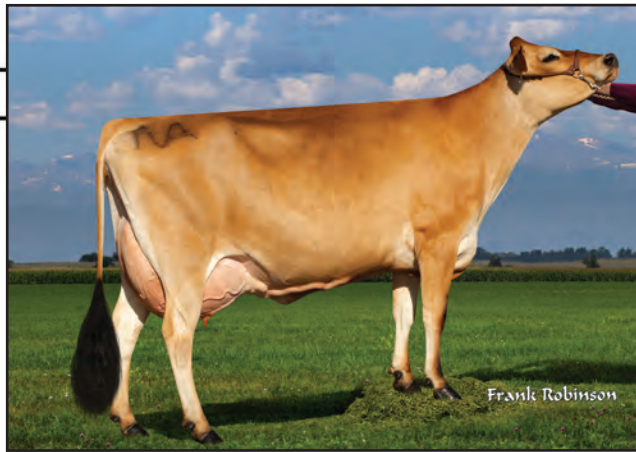
JX AARDEMA 54636 {3}, VG-87% Dam of Lot 110