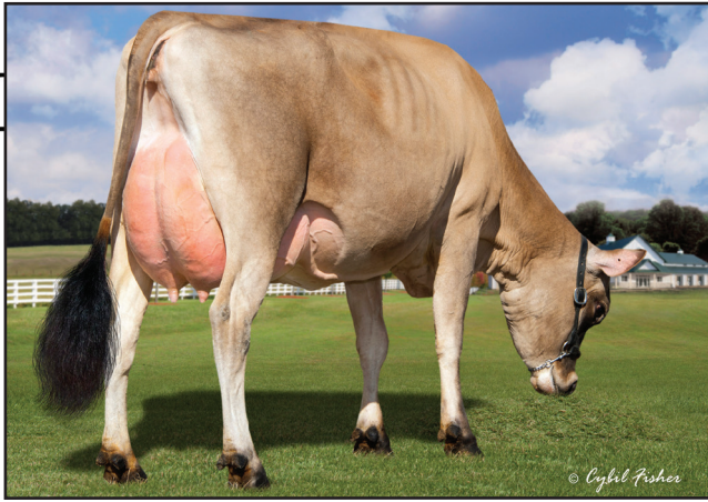
GOFF PHAROAH CIRCUS ACT-ET, E-90% Grandam of Lot 111