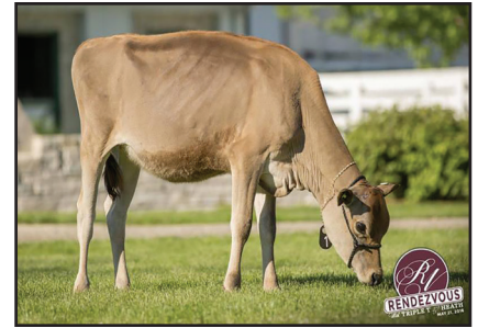
RIVER VALLEY LEMONHEAD CARNIVAL-ET Dam of Lot 111