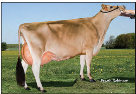
Sold in the 2011 Pot O'Gold Sale Heinz Lotto Linette 7132 {4}, VG-88% 4-10 305 3x 21,770 4.8% 1,039 3.7% 797