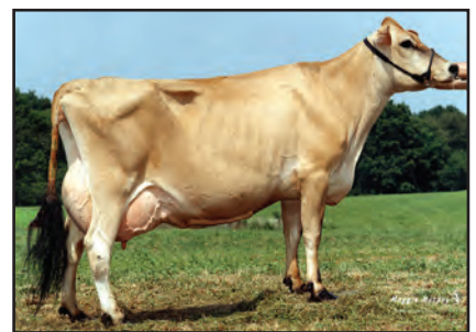
SC MILLIE Fifth Dam of Lot 117