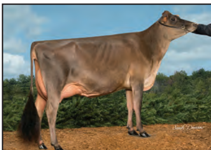
RATLIFF APPLE JACK ANSLEY-ET Sister to the Dam of Lot 126