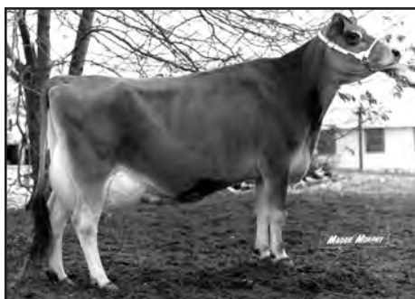
Sold in the 1971 Pot O'Gold Sale Generators Faustine of Ogston, E-93% 4-3 365 24,440 4.3% 1,059 Dam of A-Nine Top Brass Winner, 1974 Pot O'Gold Production Contest