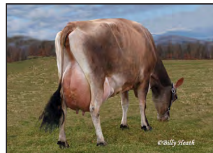
QA/WF HALLMARK DELIRIOUS Great-Grandam of Lot 124

SUNSET CANYON DOMINICAN-ET USA 117013483 GT50K BBR 100 JH1F 1JE770 CDCB GPTA S 08/01/2019 5655DAUS 528HRDS 3%RIP 99%R 569M 0.05% 37F 33%ILE 99%R 0.01% 22P 304CM$ 293NM$ 271FM$ 264GM$ 3.5PL 0.1LIV 0.8DPR 0.1CCR 3.7HCR 2.85SCS AJCA 08/01/2019 1569DAUS GPTAT 99%R -0.5 GJUI -2.8 GJPI 99%R 88