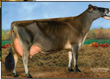
RATLIFF PRICE ALICIA Grandam of Lot 126