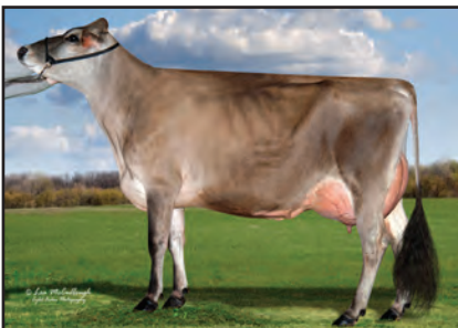
DEERVIEW PREMIER COGIRL-ET Sister to the Grandam of Lot 128