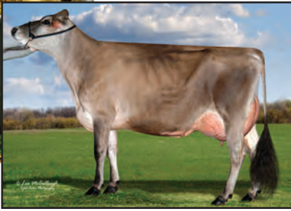
DEERVIEW PERMIER COGIRL-ET Grandam of Lot 118