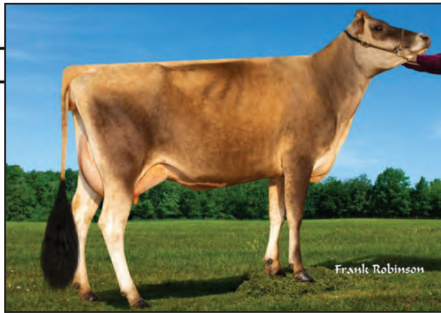
ASPEN GROVE LEMONHEAD CLAIRE, VG-84% Dam of Lot 136