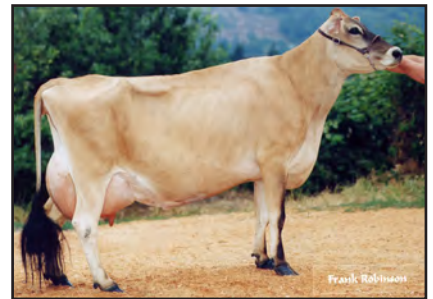
SUN VALLEY LESTER ACTRESS Fifth Dam of Lot 107