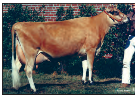
Sold in the 1967 Pot O'Gold Sale Ettas Master Babe, E-94% 11-4 365 17,550 5.3% 922 Winner, 1970 Pot O'Gold Production Contest 1970 National Jersey Jug Futurity Winner