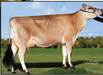
HEARTLAND FASTRACK TEMPE-ET Grandam of Lot 104