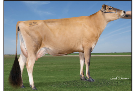
JER-Z-BOYZ BULLISTIC 48933 {6}-ET