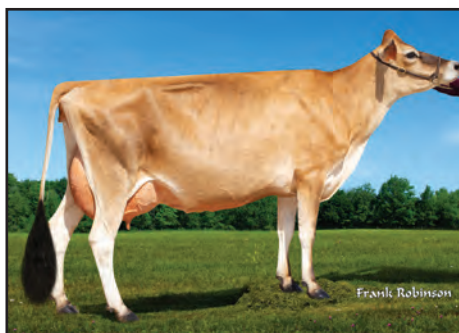
Sold in the 2016 Pot O'Gold Sale Gram-Way Chili Daphne-ET, VG-87% Projected to 17,315—814—635 ME at 2-11