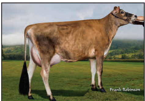
Sold in the 2013 Pot O'Gold Sale Lost Hill Dimension Holly, VG-84% 1-10 291 19,680 6.7% 1,325 3.7% 737 Winner, 2016 Pot O'Gold Production Contest