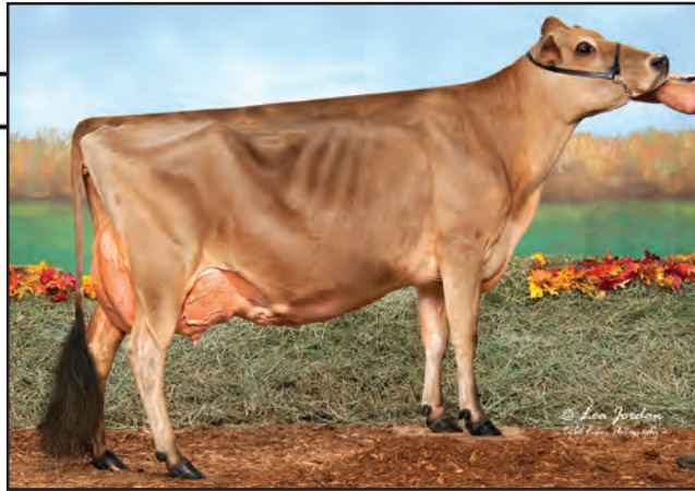
BRJ EXCITATION BOWTIE MINT R-7, E-94% Grandam of Lot 122