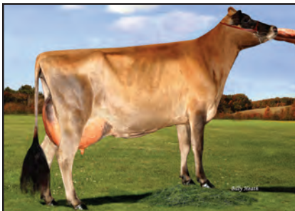
DEERVIEW REACTION KATIE-ET Sister to the Grandam of Lot 128