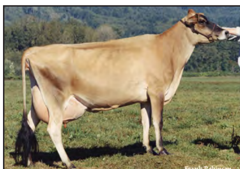
Sold in the 1997 Pot O'Gold Sale Rebob Barber Hurrah, E-90% 1-11 305 19,070 5.4% 1,021 372% 702 Winner, 2000 Pot O' Gold Production Contest