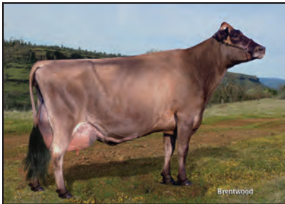
BW AVERY KATIE ET121-ET Fourth Dam of Lot 128