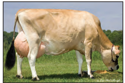
Sold in the 2005 Pot O'Gold Sale Ahlem Jace Charm 15069-ET, VG-88% 2-1 305 3x 33,550 4.6% 1,546 3.1% 1,048 Winner, 2008 Pot O'Gold Production Contest