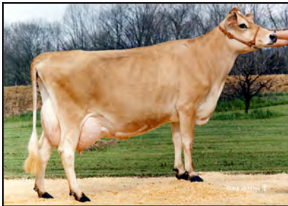
GABYS HERMITAGE ROXETTE Seventh Dam of Lot 124