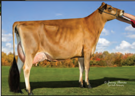
Sold in the 2017 Pot O'Gold Sale Sun Valley Jive Tart, VG-85% 1-9 305 3x 19,890 5.5% 1,100 3.7% 726