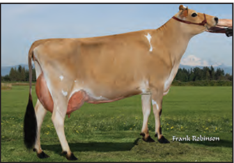
Sold in the 2009 Pot O'Gold Sale Kilgus Finalist Gem, VG-87% 1-11 365 36,400 5.0% 1,816 3.4% 1,226 Winner, 2011 Pot O'Gold Production Contest