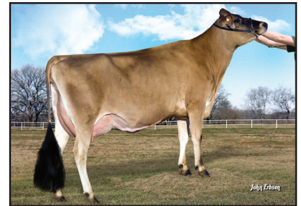
GOFF VALENTINO 9595 Great-Grandam of Lot 111