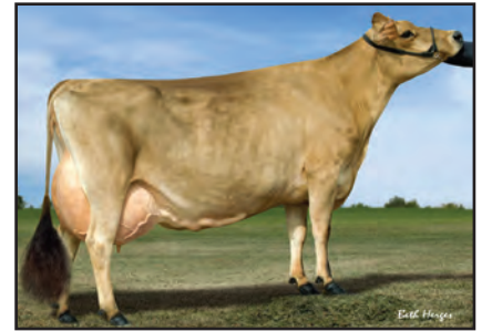
HILL TOP ACE MORGAN Fourth Dam of Lot 113

SISTER(S): IGL CHILI MERCEDES-ET 83% 2-11 305 3 22750 5.0 1130 3.4 777 102DCR 2684C IGL ISAAC MAPLE-ET 85% 1-10 305 3 21220 4.3 910 3.7 782 93DCR 2542C IGL TEXAS MISSY-ET 84% 1-11 305 3 23500 4.6 1081 3.6 847 92DCR 2903C IGL TEXAS MAYA-ET 84% 2-10 305 3 21990 4.7 1040 3.6 799 93DCR 2763C IGL TEXAS MAGIC-ET 90% 3-02 305 3 24880 3.9 962 3.5 878 104DCR 2758C ROWLEYS 948 CITATION A 1697 88% 1-10 305 2 15930 4.6 738 3.6 568 95DCR 1963C