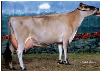
ROZEVIEV DORIE D RACHEL Fourth Dam of Lot 126