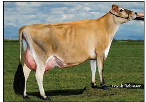
Sold in the 2012 Pot O'Gold sale Peelers Louie Presca, VG-87% 2-11 305 27,900 4.6% 1,274 3.4% 961 Winner, 2015 Pot O'Gold Production Contest