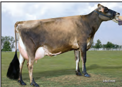
HEARTLAND IMPRESS TULIP-ET Sister to the Grandam of Lot 104