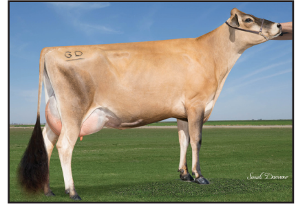
JER-Z-BOYZ PREMIUM JOYCE 48744 {6}-ET