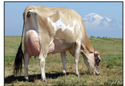
PLEASANT NOOK F PRIZE CIRCUS, E-97% Sixth Dam of Lot 111