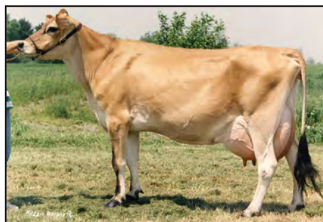
Sold in the 1991 Pot O'Gold Sale Mar Kut Sooner 920, E-91% 3-0 305 24,190 4.7% 1,131 3.2% 774 Winner, 1996 Milking Competition Brazil National Winner, 1994 Pot O'Gold Production Contest