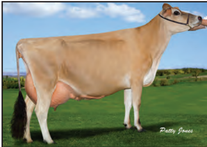
GABYS ARTIST AMBROSIA Fifth Dam of Lot 124