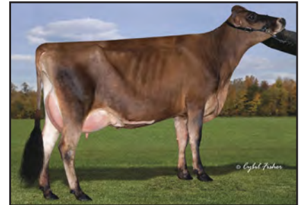
IGL TEXAS MISSY-ET Sister to the Grandam of Lot 113